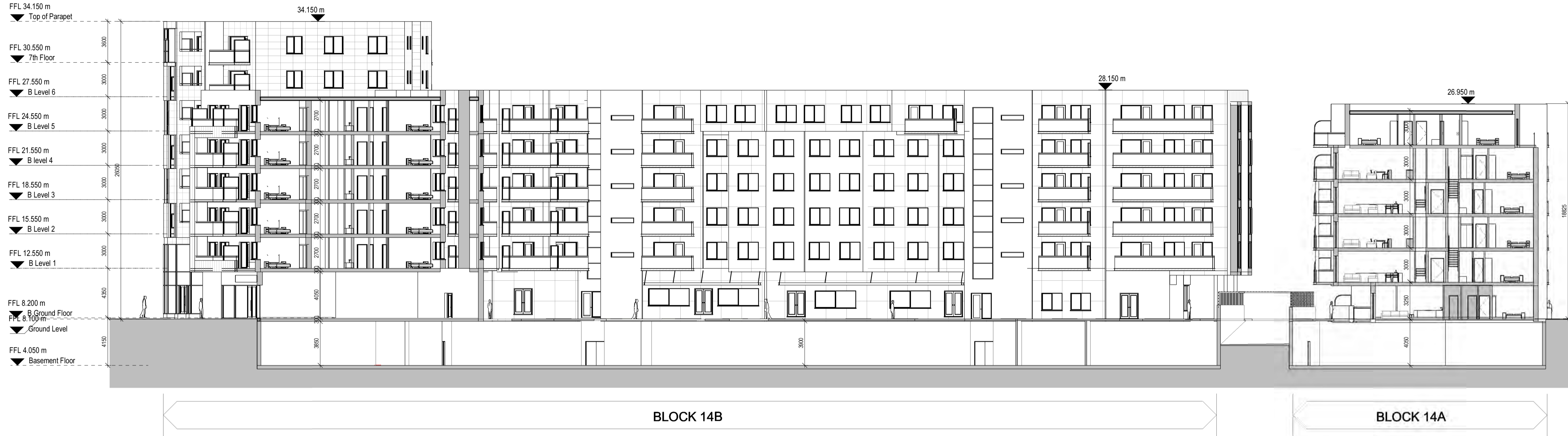
BLOCK 14 SECTION E-E Scale 1 : 200

GENERAL NOTES - ** Do not scale from this drawing *** Use figured dimensions only © This drawing is copyright. No part of this document may be reproduced or transmitted in any form or stored in any retrieval system from the copyright holder, except as agreed for use on a project, for which the document was originally issued.